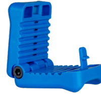
JONARD MS-6 CORD SPLITTER