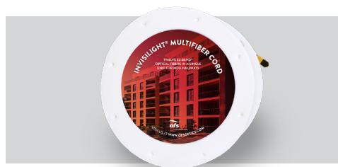
InvisiLight MDU Cord Up Risers and Down Hallways