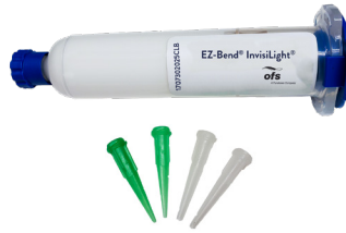
30 mL ADHESIVE TUBES