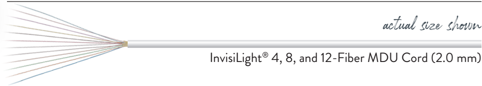
InvisiLight® 4, 8, and 12-Fiber MDU Cord (2.0 mm)