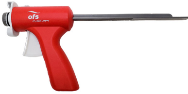
ADHESIVE APPLICATION TOOL