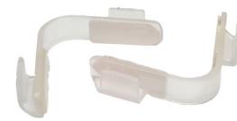
BEND LIMITERS (OPTIONAL)