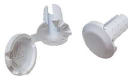
WALL CAPS AND PLUGS