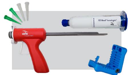
Installation System Installation Tool and Adhesive