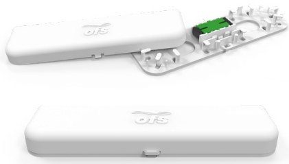
COMPACT POE MODULE