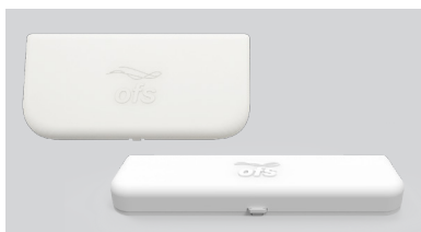
Point of Entry (POE) Modules Placed Above Doorways in the Hall